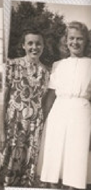
Visitors To Kewanee City - We enjoyed their visit and their home. 4/19/34