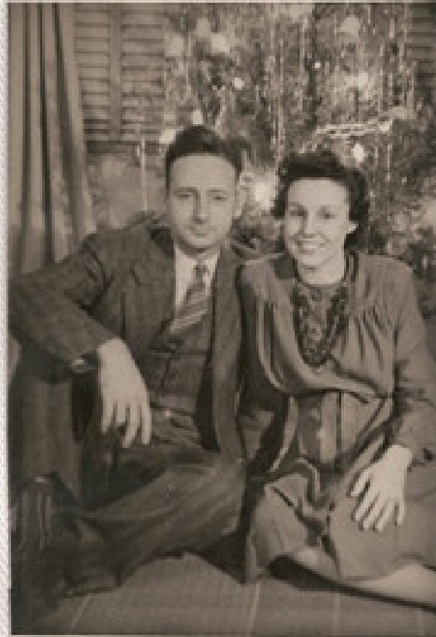
CHRISTMAS 1943 725 WENTWORTH RD COLUMBUS OH