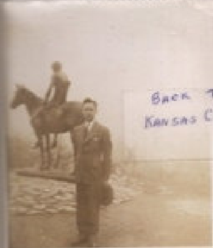
BACK TO KANSAS CITY