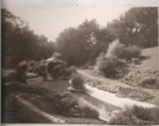
OUR "DREAM HOME" IN Kansas City!