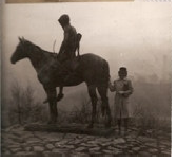
EASTER - 1950 - in front of 42nd Street