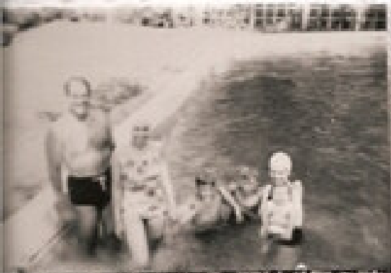
Rosa's Swimming Pool